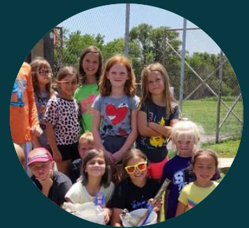
Gypsum Summer Youth Program Fund for Greater Salina- $7,000

Angel Child Care (Church of the Cross) Prairieland Market Ashby House, Ltd. Saint Francis Ministries Bethany College Salina After Prom Big Brothers Big Sisters of Salina Salina Area Technical College Blessed Hope Family, Inc. Salina Art Center City of Assaria Salina Child Care Association, Inc. City of Gypsum Salina Education Foundation Cornerstone Classical School Salina Emergency Aid Food Bank CrossPoint Church Salina Rescue Mission Domestic Violence Association of Central Kansas (DVACK) St. John's Missionary Baptist Church Gypsum Summer Youth Program Stiefel Theatre Little Samaritans Child Development Center, Inc. Sunrise Presbyterian Church Love, Chloe Foundation The Salvation Army, Salina New Heights Therapeutic Riding, Inc. Trinity United Methodist Preschool OCCK, Inc. USD 305 PIN- People in Need Payee Service USD 306 Veterans of Foreign War, Post 1432