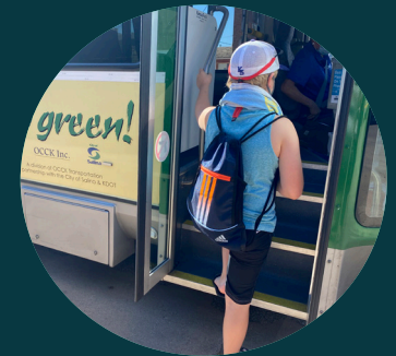
OCCK, Inc., Transportation for After School Programs Dane G. Hansen Community Grant Fund- $6,400