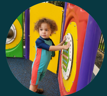
Angel Child Care (Church of the Cross) Toddler Playground YW Legacy Fund- $10,000